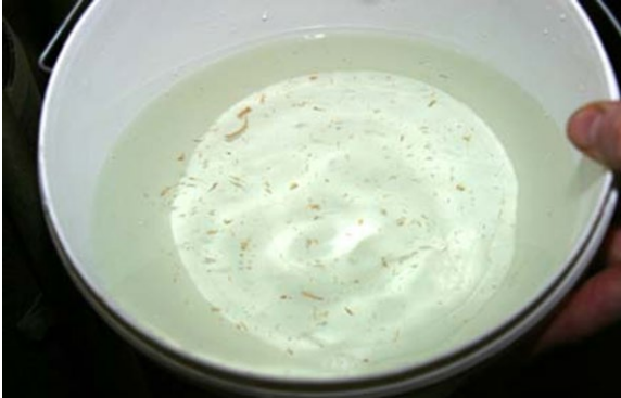
Figure 2 Biofilm